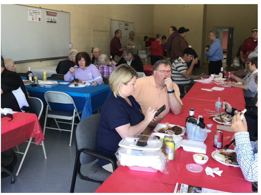
Photos 1-3: Diners filled the sally port and outside seating areas as numerous guests came out to support the Sheriff's Café and C.O.A.C.H.

Funds donated to C.O.A.C.H. go directly to assist cancer patients and their families in Coosa County. For more information, visit www.coachcoosa.org.