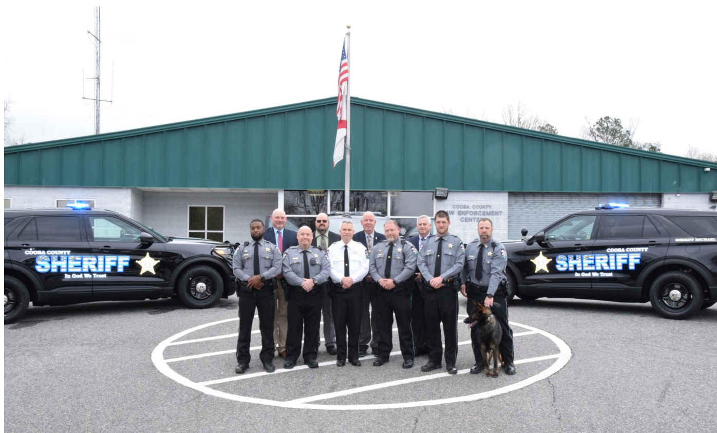
Members of the Coosa County Sheriff's Office stand between two of the newly acquired and equipped vehicles that have been added to their fleet recently.